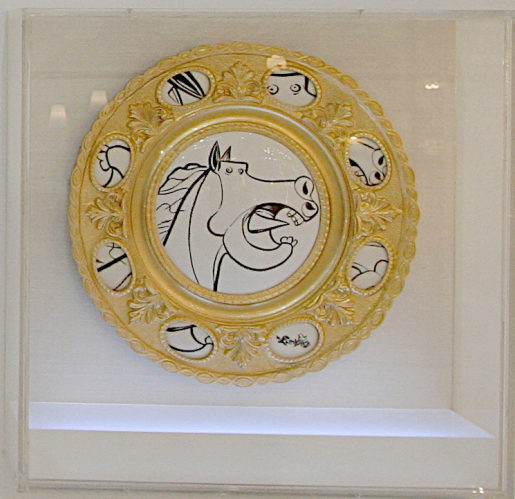
JON MIKEL Vision of Picasso